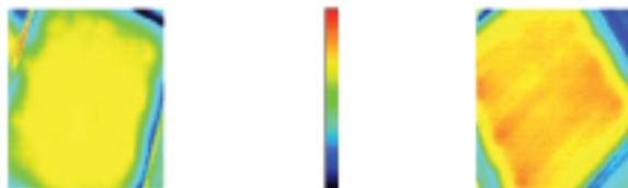
Temperature across screed surface 90 mins after turning under floor heating on

Sand Cement Surface Temperature Gyvlon Screed